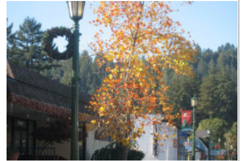
A festive decoration in Downtown Guerneville

Next Meeting: Tuesday, March 22 1 pm at the Chamber Office/ Plaza - bring your concerns- input -ideas -comments